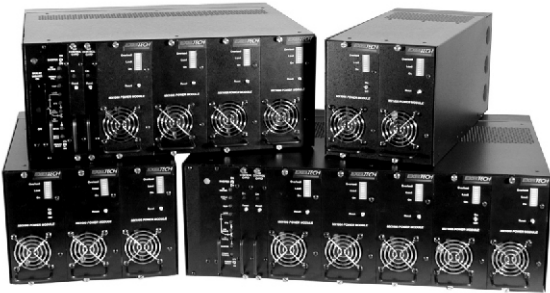
MX SERIES FAMILY

EXELTECH manufactures the world's first truly redundant, modular inverter system; the most reliable inverter system available. No single malfunction will cause the inverter system to fail. Modules are "hot" insertable. Power levels are expandable , and modules can be added or replaced without interruption in power to your critical loads.